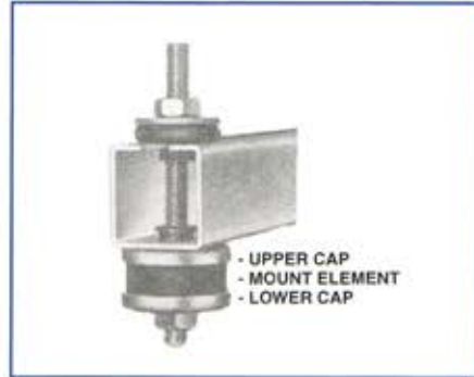
USE WITH MOUNTING RAILS

Rigid Resilient Hanger consist of a resilient rubber mount held between two zinc plated steel caps for uniform distribution of load.